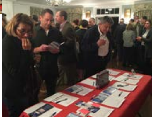
The Silent Auction in action

Save the date of Thursday, April 16, 2015 for the annual Beat the Odds dinner so that we can support this very worthy cause one more time.